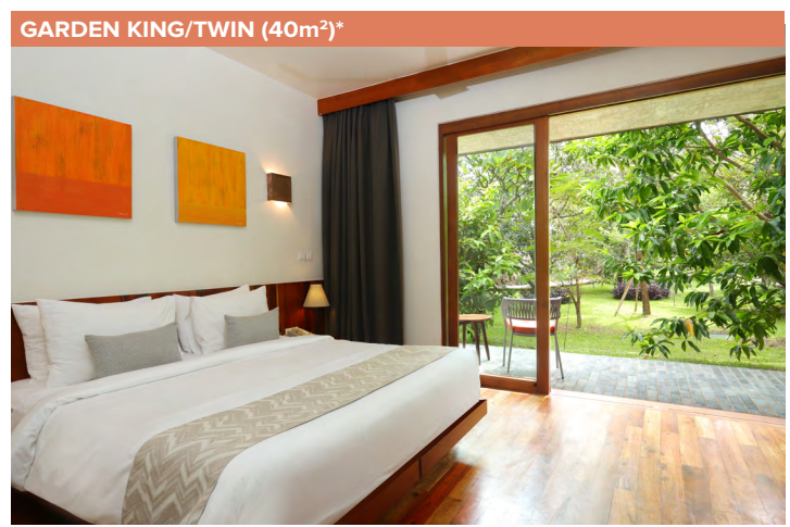
* Sizes exclude bathrooms & outdoor areas