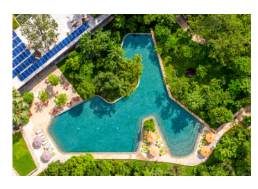
The Main Pool

Natural stones holding 1,000 m³ of water, one of the largest in Siem Reap.